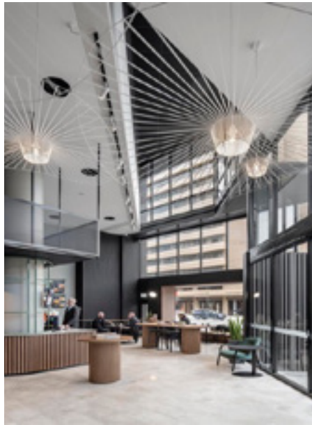
↑ 26 Flinders Street, Adelaide SA