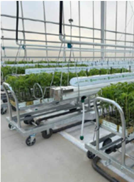
↑ Corval Glasshouse Fund