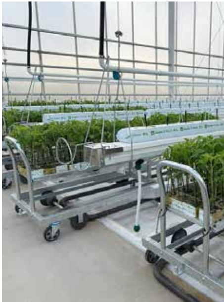
↑ Corval Glasshouse Fund