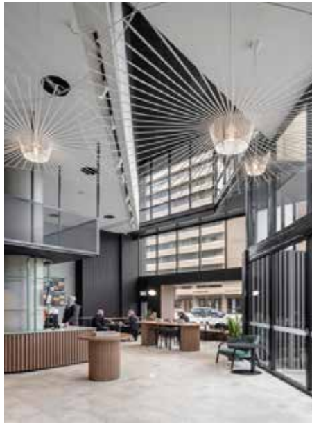
↑ 26 Flinders Street, Adelaide SA