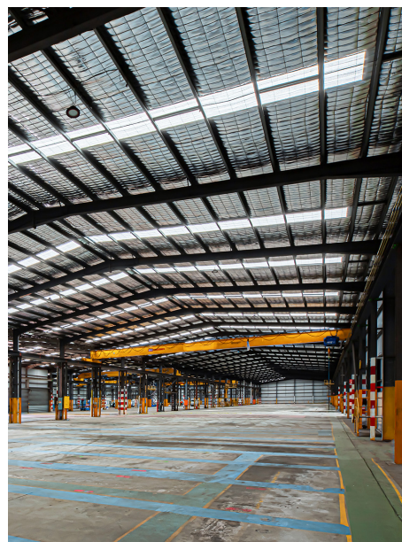
↑ 33 Shaddock Avenue, Villawood NSW