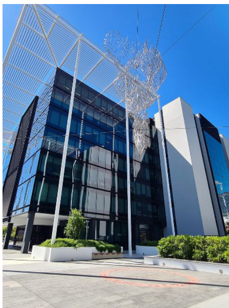
↑ Corval Workzone Trust