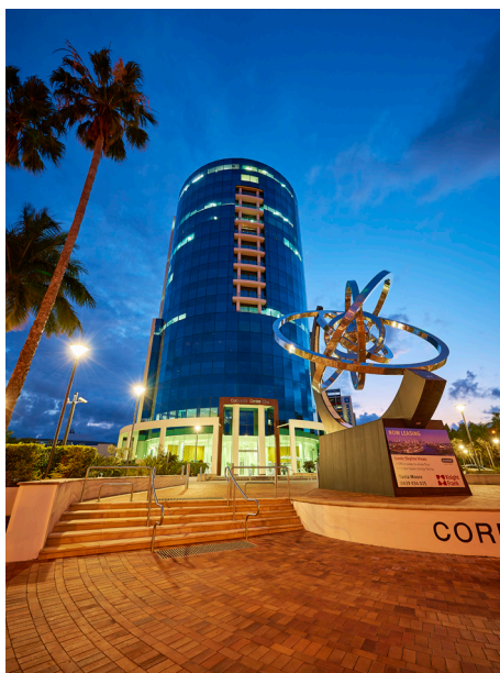
↑ Corval Corporate Centre Trust