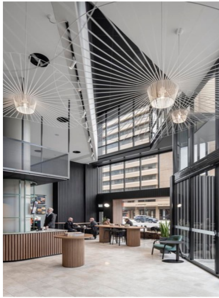
↑ 26 Flinders Street, Adelaide SA