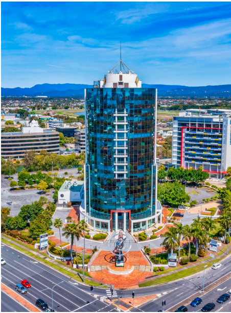
↑ Corval Corporate Centre Trust