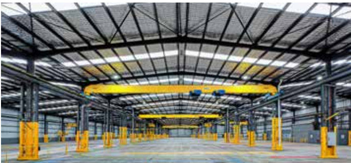
↑ 33 Shaddock Avenue, Villawood NSW

Performance is shown after all fees and costs are accounted for. Inception date was 28 February 2022. Past performance is not a reliable indicator of future performance.