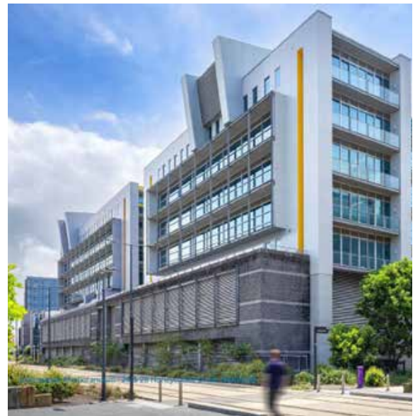
↑ 26-28 Honeysuckle Drive (rear), Newcastle NSW