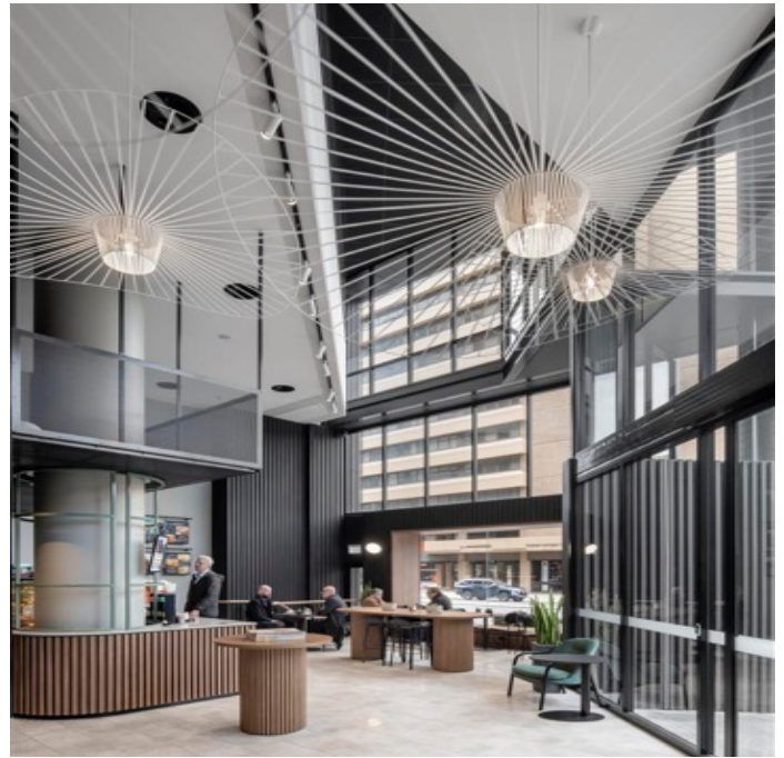
↑ 26 Flinders Street, Adelaide SA