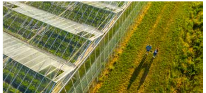
↑ RF Corval Glasshouse Fund